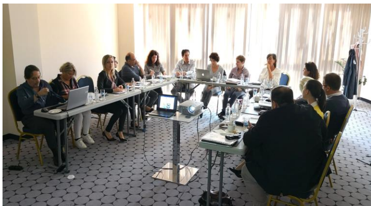
3rd International Meeting of the Sustain-T Project

On 4 and 5 October, the partners involved in the Sustain-T project met at their Third International Meeting in Bulgaria, specifically in Sofia.