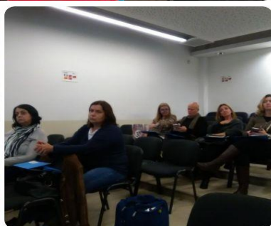
Events in Lisbon, Almada, and Montijo

The Taking to the Top project came to an end, and it has held 3 events to present the final products, with emphasis on the Course Referencial of the skills of adult trainers and educators for the 21st Century. Some of the modules were presented with greater detail including some of the proposed activities. These events took place in Lisbon at the Vergílio Ferreira School, in Almada at Emídio Navarro High School, and at Montijo at the Qualifying Center of the Poet Joaquim Serra School.