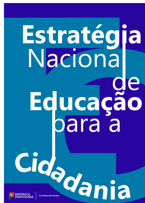
National Strategy for Citizenship Education