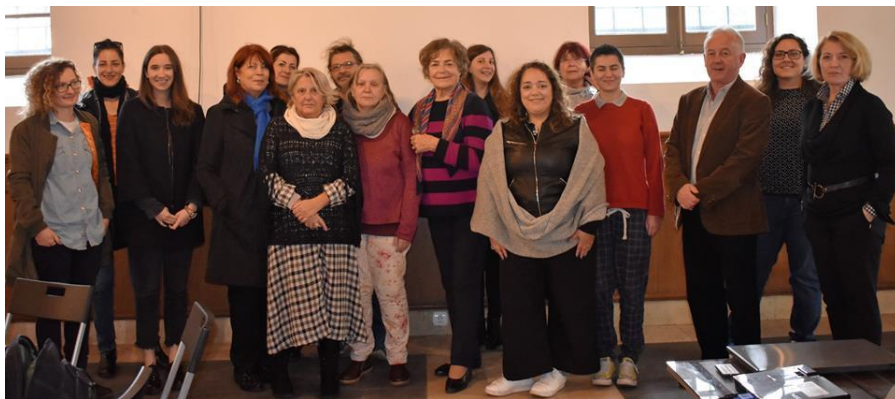
Last Transnational Meeting #RefugeesIN, Lisboa, 23 November 2018.

The RefugeesIN team met to review the work done and the results obtained and start preparing the final report. The team is proud of the results obtained, confident about the sustainability of RefugeesIN and hopes soon to have a new opportunity to work together at European level.