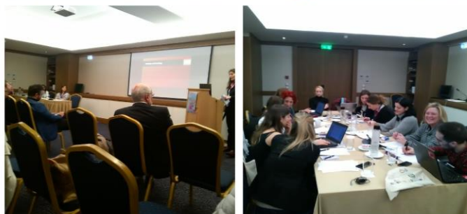
End of the DIVINA Project