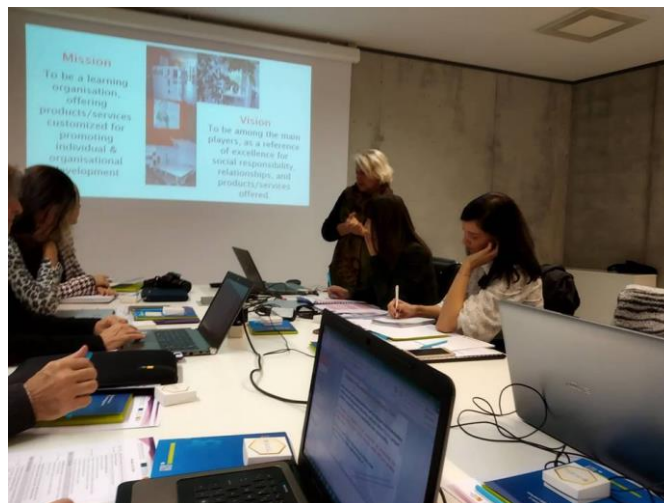
Flourish Kick-Off Meeting

We just finished presenting AidLearn at the Facilitating Organizational Innovation/ FLOURISH Kick-Off Meeting, at the Kaunas Science and Technology Park (Lithuania). FLOURISH project continues the effort undertaken by InnoWork Project to foster innovation in SMEs. It aims at involving the whole company/cluster and stakeholders and preparing them as facilitators to run the entire process by creating a training programme.