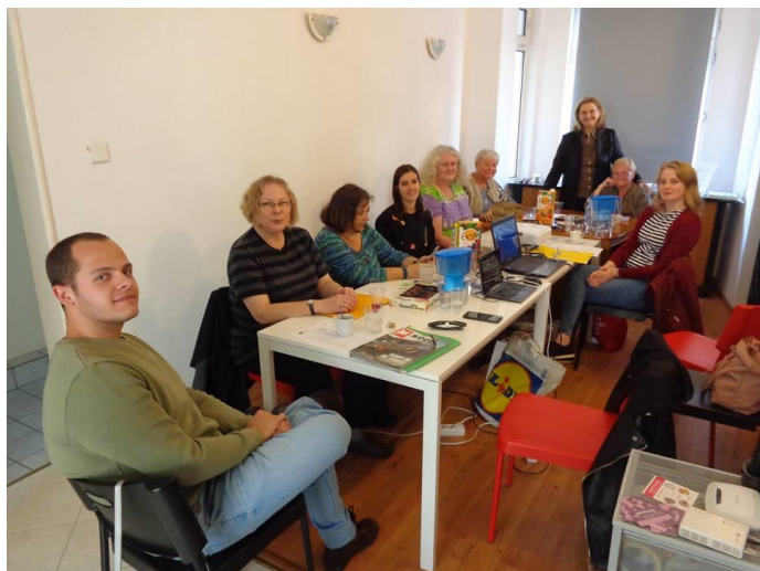
4th Transnational Project Meeting

During the 4th transnational meeting in Sofia on 23 and 24 October 2018, the discussion of the partnership focused mainly on the occurrence and logistics of the 2nd workshop of the project in Stuttgart. There was also a review of the progress of the project, as well as a review of the quality assessment and monitoring of project events to date, and a discussion on the dissemination of the SPADE project by each of the partner organizations. In the end, the partnership planned the next meeting to be held in Gdansk in April 2019.