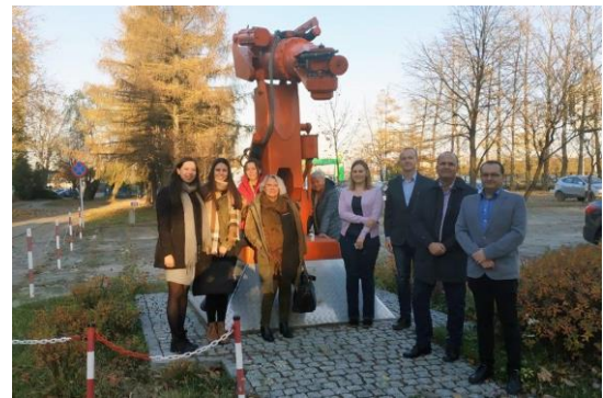
COLED Kick-off meeting at Warsaw, Poland, on 6th November

Project Collaborative Learning Environment for engineering education – CoLED is developed within Erasmus + Programme, Key Action 2: Cooperation for innovation and the exchange of good practices and is a 2-year project starting from October 2018 and ending in September 2020.